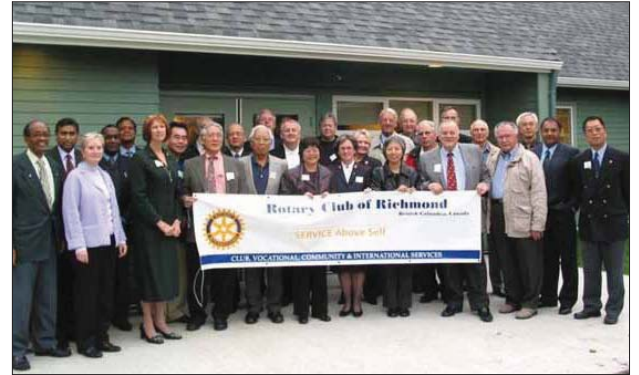
Rotary Hospice House opened in 2005 thanks to the fundraising efforts of The Rotary Club of Richmond.

The club invited the Salvation Army to partner on the project which resulted in joint capital fundraising activities, completion of a development plan for the hospice, the purchase of property, and the procurement