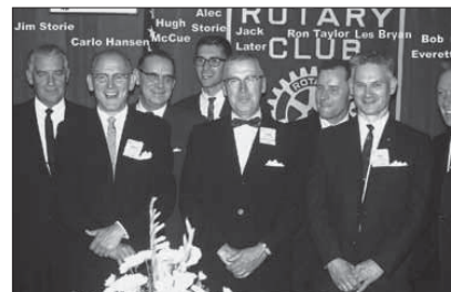
The Rotary Club of Richmond photo The Rotary Club of Richmond received its charter on April 12, 1962.

Since that date, The Rotary Club of Richmond has held its meetings in a number of locations; Richmond Golf and Country Club, Radisson Hotel, Abercorn Inn, Four Points by Sheraton Vancouver Airport and now the River Rock Ca-